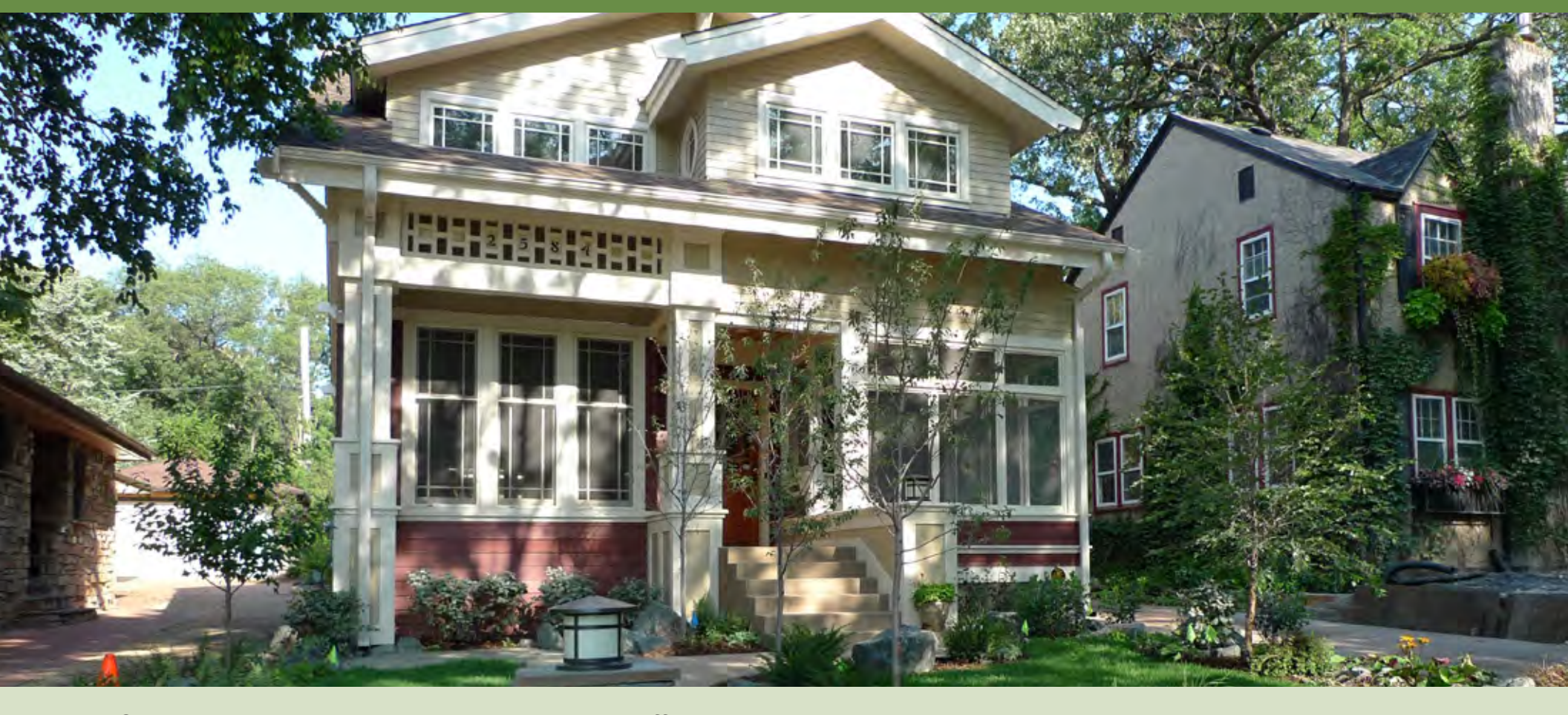
Classic design meets new technology in ultra-efficient LEED Platinum home

Featuring a traditional turn of the century design, the Kenilworth Bungalow demonstrates that aesthetics need not be sacrificed when building a green home. The stylish bungalow uses structural insulated panels and other energy-saving technologies to achieve a HERS Index of 49, making it 51 percent more efficient than an average code-built home. With such impressive energy savings, this 3,394 sq. ft. LEED Platinum home had no trouble claiming the Overall Competition Runner-Up and winner of the Single Family Home over 3,000 sq. ft. category in the 2010 SIPA Building Excellence Awards.