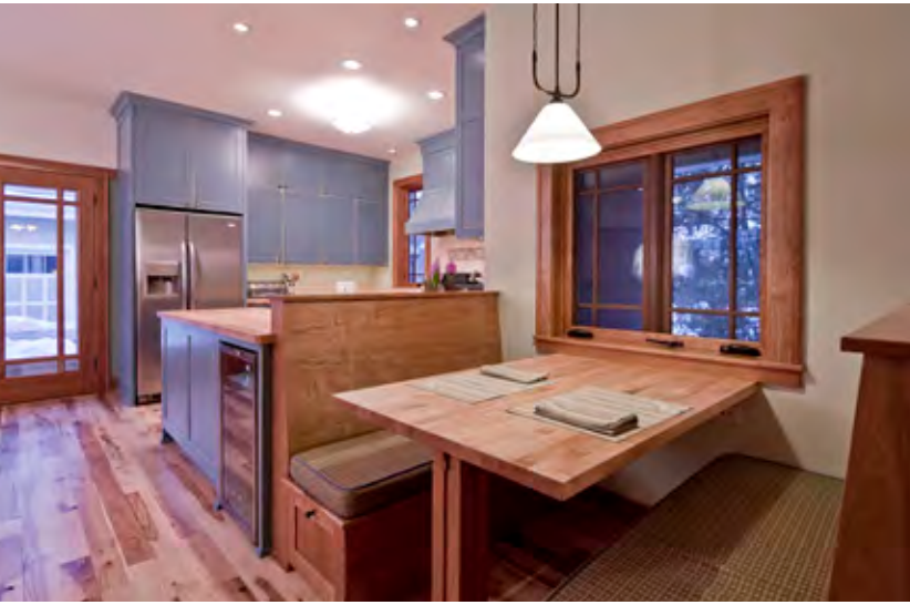
All cabinetry and moldings were made with FSC Certified wood.