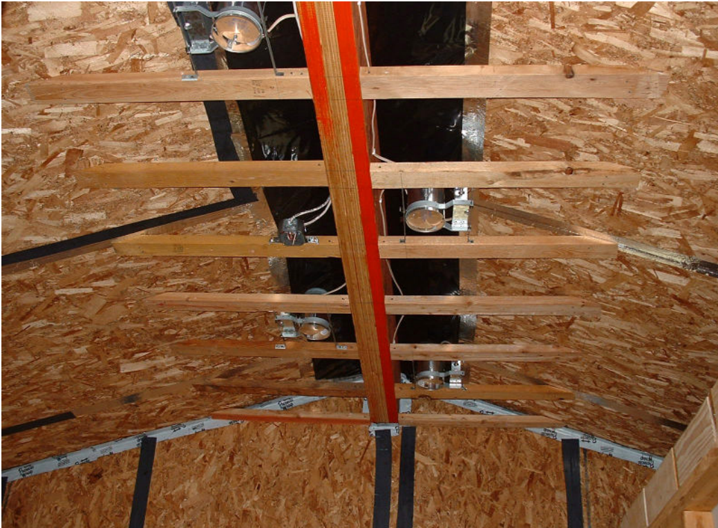
IMAGE 9.9 ALTERNATIVE FURRED-DOWN CEILING