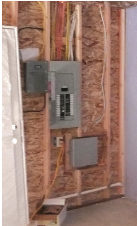
IMAGE 9.6 WHEN DESIGNING THE MECHANICAL ROOM, PLAN FOR FRAMING OUT THE WALL TO ACCOMMODATE THE ELECTRICAL BOX AND ALL WIRING.

Note: not shown are the four screw fasteners required to support the weight of a ceiling fan.